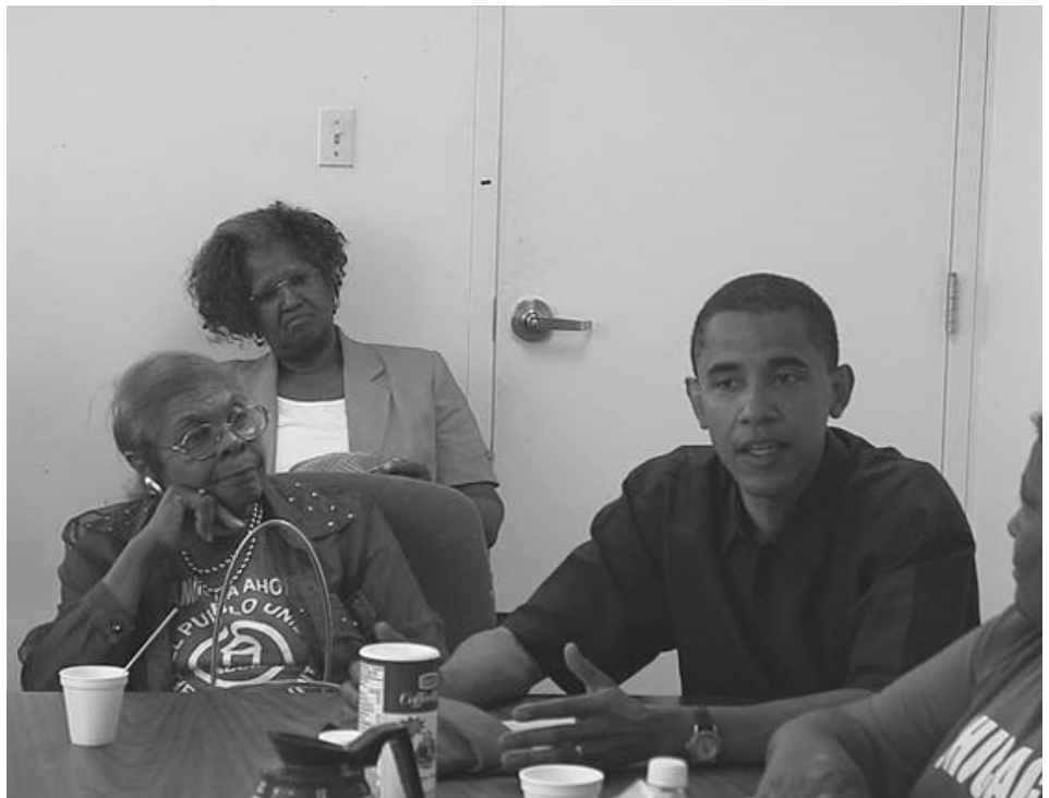
Barack Obama, a former benefactor of and organizer for ACORN, meets with ACORN activists in this undated photograph published in ACORN's Social Policy magazine in 2004. Obama has said that his days spent community organizing were the "best education" he ever had. After organizing for ACORN's Project Vote affiliate, Obama lectured at ACORN on organizing techniques.

Summary: The Association of Community Organizations for Reform Now (ACORN) has become America's most prominent left-wing community group. Little-known until now, ACORN has played a major role in the subprime mortgage mess that has undermined Americans' support for free market problem-solving and set off a worldwide chain of financial troubles. It is also implicated in vote fraud schemes from coast to coast. ACORN aims to give America change that socialists can believe in – by any means necessary. It is deliberately organized to avoid scrutiny. But with an FBI probe underway, millions of dollars in back taxes owing, and a racketeering lawsuit pending, it may finally have to answer for its many misdeeds. (This is a companion article to this month's Labor Watch, which looks at ACORN's inconsistent approach to labor issues.)