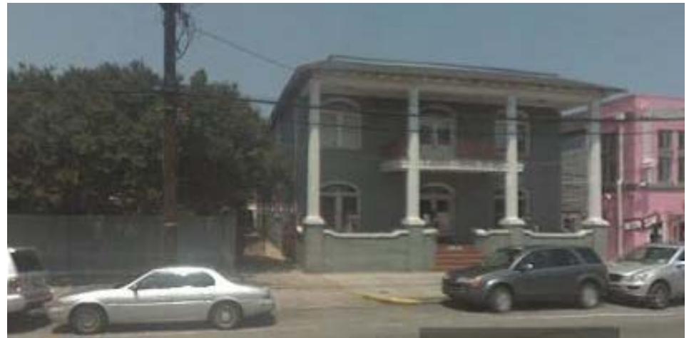
There better be more than one bathroom: Amazingly, almost 300 ACORN-affiliated groups officially live in this one house on Elysian Fields Avenue, New Orleans.

Obama's ties to ACORN go back at least to 1992. That's the year he directed voter registration for Project Vote, an ACORN affiliate. Obama helped train ACORN lead-